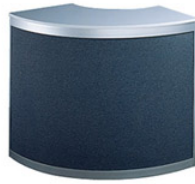
600103 - Exhibit, Counter, 1M Curved