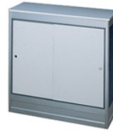
600101 - Exhibit, Counter, 1M x 1/2M x 40"H