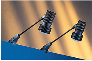
600110 - Exhibit, Armlight Black