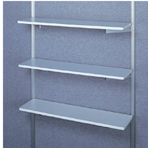
600243 - Exhibit, Shelf, 1M x 10" Deep