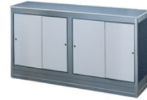
600102 - Exhibit, Counter, 2M x 1/2M x 40"H