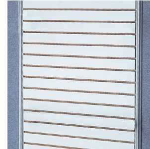
661931 - Exhibit, Panel, Slatwall, 1M x 8'