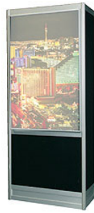
600222 - Exhibit, Light Box, Medium 37"x56"