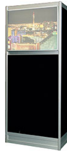
600223 - Exhibit, Light Box, Small 37"x28"