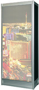
600221 - Exhibit, Light Box, Large 37"x85"